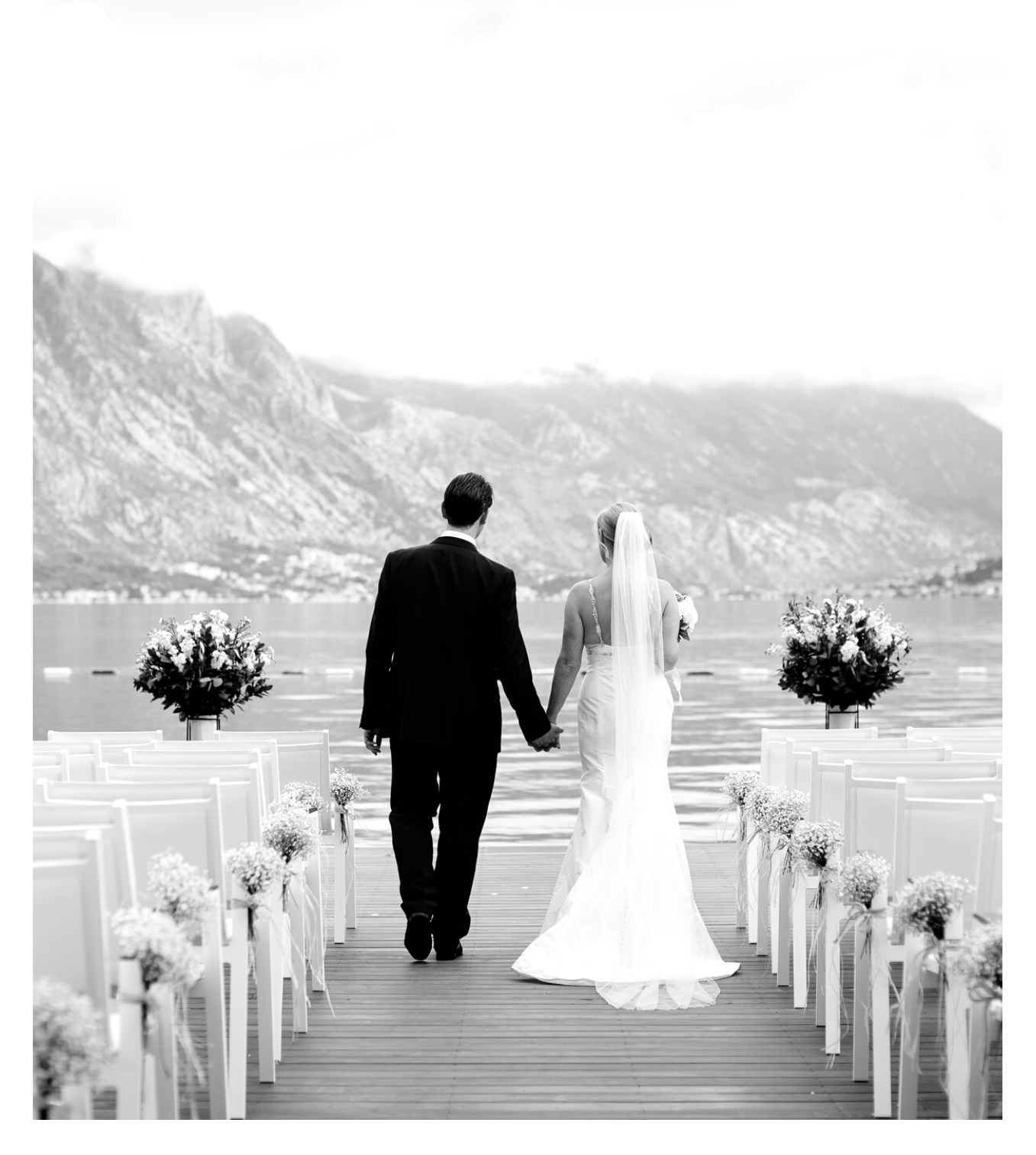
Ultimate Wedding Guide